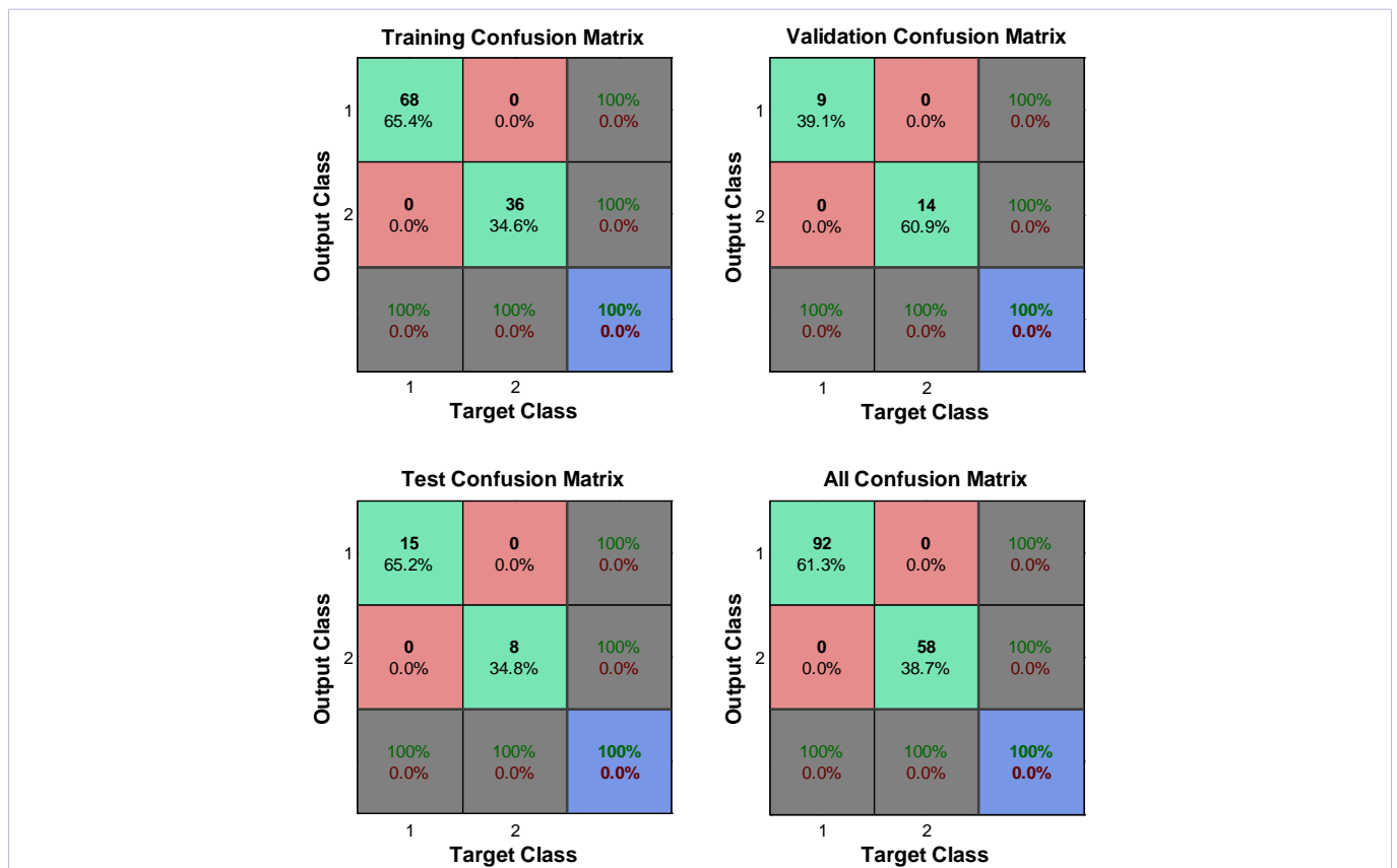
Figure 1: Best validation performance with regard to PRNN.